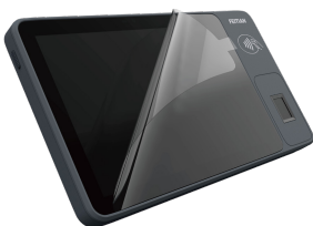
Screen Protector Hydrogel film