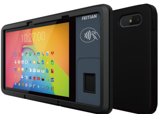
Silicone Cover Customized colors